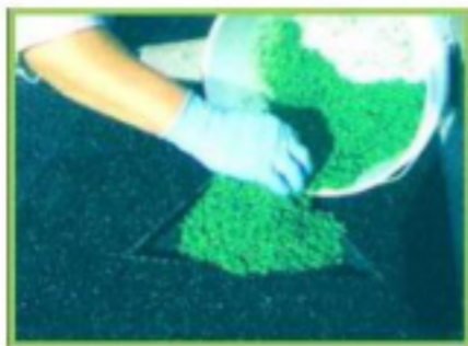
Overfill the hole to allow for compression