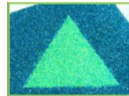
Leave area to cure