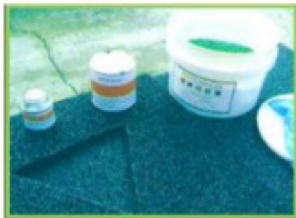
Ensure all materials are close to hand