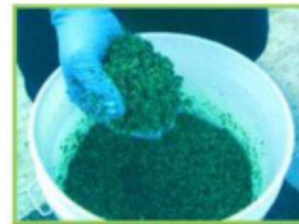
Mix the granules and polyurethane together in the bucket