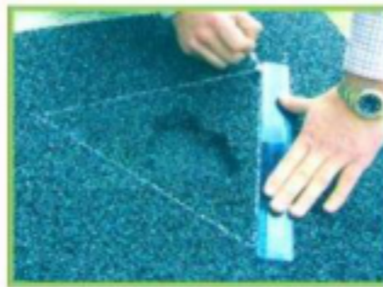
Mark area to be cut back