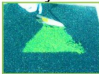
Screed and compress granules into area