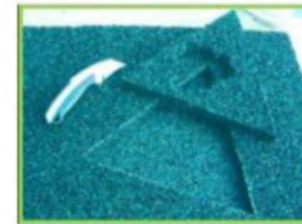
Remove damaged area