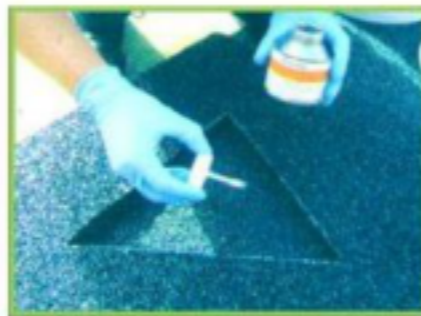
Apply some primer to all edges to act as a bonding agent