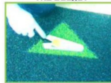
Ensure granules are level and in line with existing surface