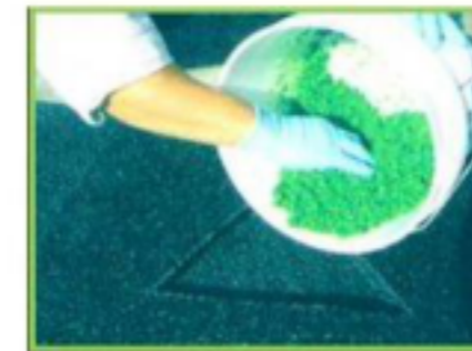
Pour mixed granules into area