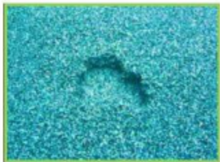
Remove all loose material from damaged area